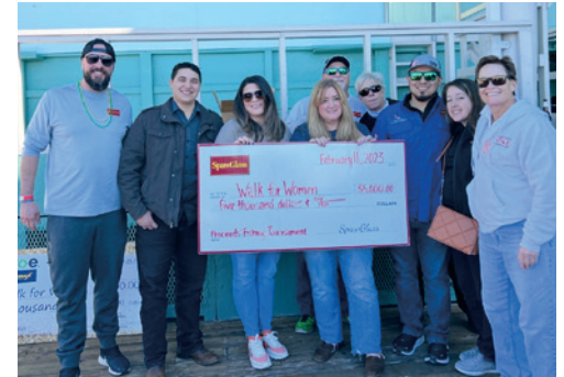
▲ South Texas Division team members present Friends of South Padre Walk for Women with a $5,000 donation from proceeds of the SpawGlass-South Texas 17th Annual Bay Fishing Tournament.

SpawGlass is proactively aiming to encourage more females to join – and stay – in the construction industry through our SpawGlass Women in Construction (SGWIC) initiative. Through SGWIC, guest speakers have led discussions about career advancement, life balance and other relevant issues. By continuing these conversations and representing the SpawGlass Way through equity and inclusivity, our SpawGlass ladies are forging a path for themselves as well as future generations. ■