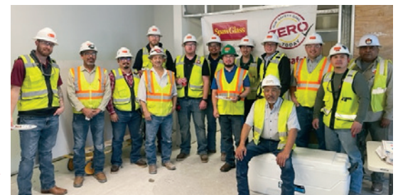
The CHRISTUS Spohn Hospital Corpus Christi - South Emergency Department Expansion and Renovation project team enjoys a fun pizza lunch.