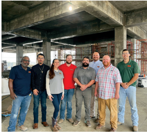
▲ SpawGlass-Golden Triangle team members host a client appreciation event for the Sabine Pass ISD school board to celebrate the board's commitment to the safety and growth of the local community.