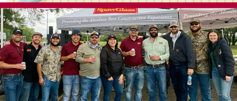
San Antonio team members participate in the ABC South Texas Chapter Sporting Clay Shoot & BBQ Cook-off.