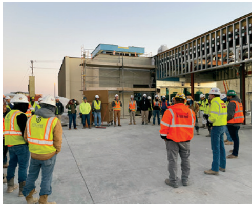
▲ North Texas team members participate in a safety stand down at the Frost Allen Financial Center jobsite.