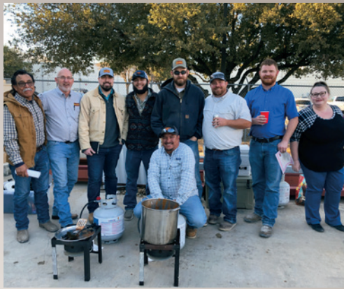
▲ The Lackland Air Force Base Airmen Training Complex Dormitory #6 team takes first place in a chili cook-off after the quarterly safety meeting at the San Antonio office.