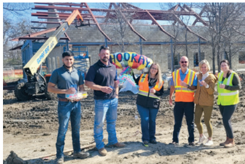
▲ The North Texas team celebrates the news that the Keith House, a modern-day meeting house in Fort Worth, will be the site of "The Keith Skyspace," 2023 by artist James Turrell.